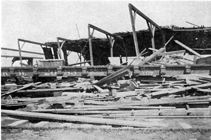
This is a picture of Pier 21 after the storm.

Reflection Questions: Again, imagine yourself back in time! Be sure to answer the following questions from the perspective of a survivor of the hurricane that hit Galveston in 1900.